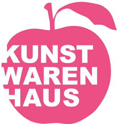
100 x 100 cm

Kunstwarenhaus Stockerstrasse 11 CH-8002 Zürich